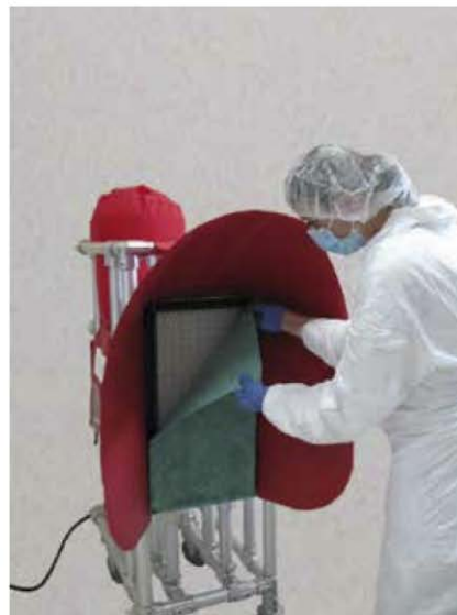
Full-Size (above) and Half-Size (left) units available to suit the needs of your facility

High levels of filtration in the cage wash area greatly reduces airborne particulates, & minimizes the opportunity for disease transmission throughout the vivarium.